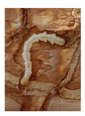
EAB larvae damage the vascular system of the tree as they feed, which interferes with movement of systemic insecticides in the tree.

Application protocols and conditions of the trials have varied considerably, making it difficult to reach firm conclusions about sources of variation in efficacy. This inconsistency may reflect the fact that application rates for soilapplied systemic insecticides are based on amount of product per inch of trunk diameter or circumference. As the trunk diameter of a tree increases, the amount of vascular tissue. leaf area and biomass that must be protected by the insecticide increases exponentially. Consequently, for a particular application rate, the amount of insecticide applied as a function of tree size is proportionally decreased as trunk diameter increases. Hence, application rates based on diameter at breast height (DBH) may effectively protect relatively small trees but can be too low to effectively protect large trees. Some systemic insecticide products address this issue by increasing the application rate for large trees.