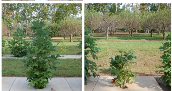
Sand Based Structural Soil

Soil mixed to CU Soil specification. Installed by Tom Smiley