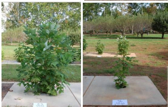
Gravel Based Structural Soil

Unscreened clay loam/sand /compost. Installed by Craig Melvin. 2.03 cu yards soil prior to compaction (23% less soil). Significant soil settlement and required replanting trees.