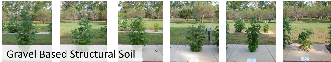
Gravel Based Structural Soil