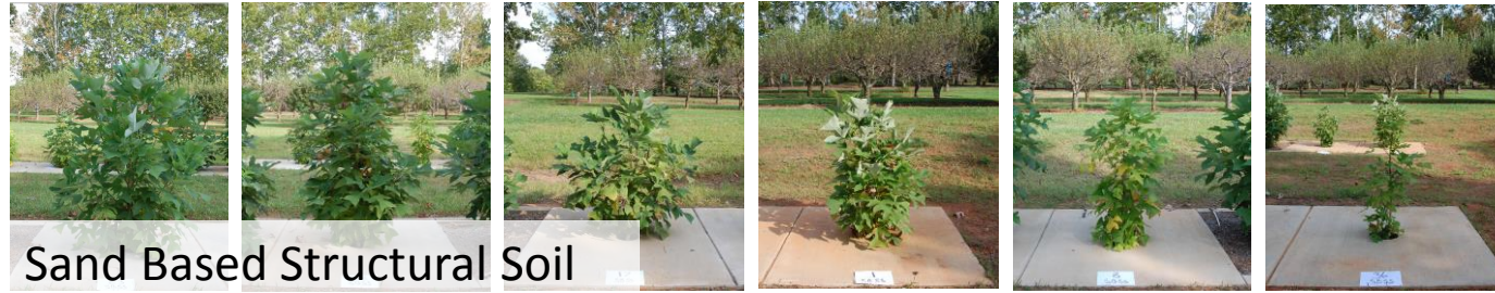
Sand Based Structural Soil