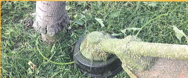
Example of damaged tree due to equipment.

Help keep the tree healthy by giving extra space between equipment (lawn mowers and string trimmers) and the tree.