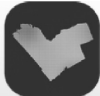
Table de direction sur le logement et l'itinérance

The Housing and Homelessness Leadership Table brings together people who have experienced homelessness, Indigenous partners, City staff, and the leaders of housing and shelter organizations to work together to plan and build a better housing system for Ottawa.